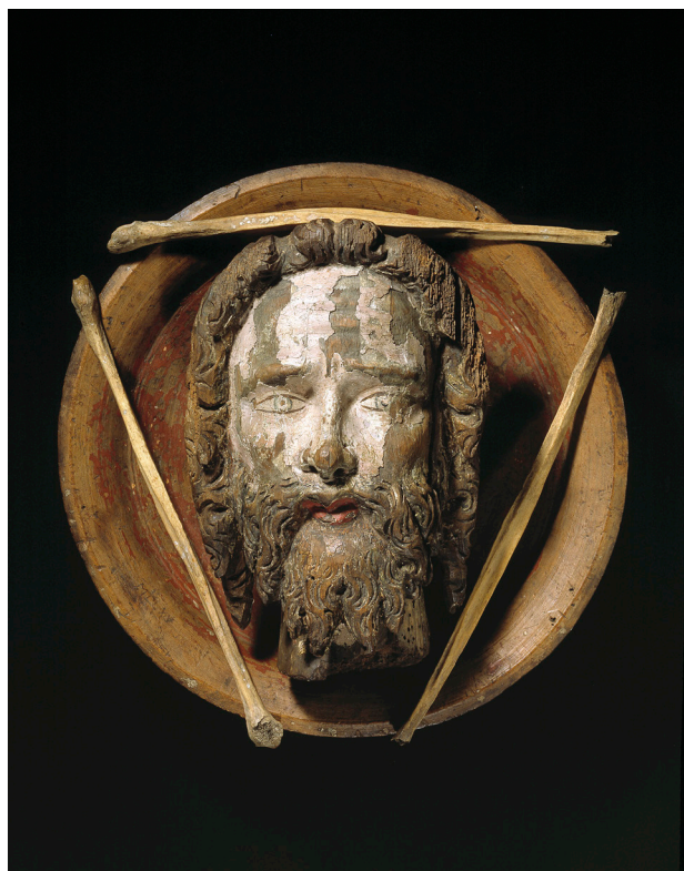
Fig. 2: St John the Baptist relics from Ørslev Church, Denmark. The platter is a later replacement.

The results of these studies have been informative, helping the team to focus its approach. For example, as described above with regard to nominal authenticity, in seeking to study relics that are the most highly comparable (e.g. in attribution, provenance, location, context), it appears useful to first seek out relics with the most ancient provenance in order to establish a basic understanding of the early origins of a particular relic tradition. This understanding can then be supplemented by information from later contexts, which may consist of fragments of relics from