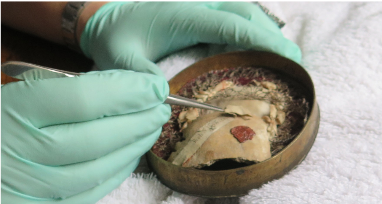
Fig. 3: Preliminary examination of a relic and authentica in context, Eglise Saint-Jean Baptiste, Namur.

The scientific analysis of relics and their contexts can thus be used to establish a basic understanding of their past, which can be compared and contrasted with available written and oral sources in order to establish useful questions and likely hypotheses concerning an object’s history (e.g. why and how such objects came to be treated as relics, and what happened to them subsequently). In the case of the authors’ research on the Wood of the True Cross, for example, this prompted the formulation of a list of aspects (including provenance, reliquary context,