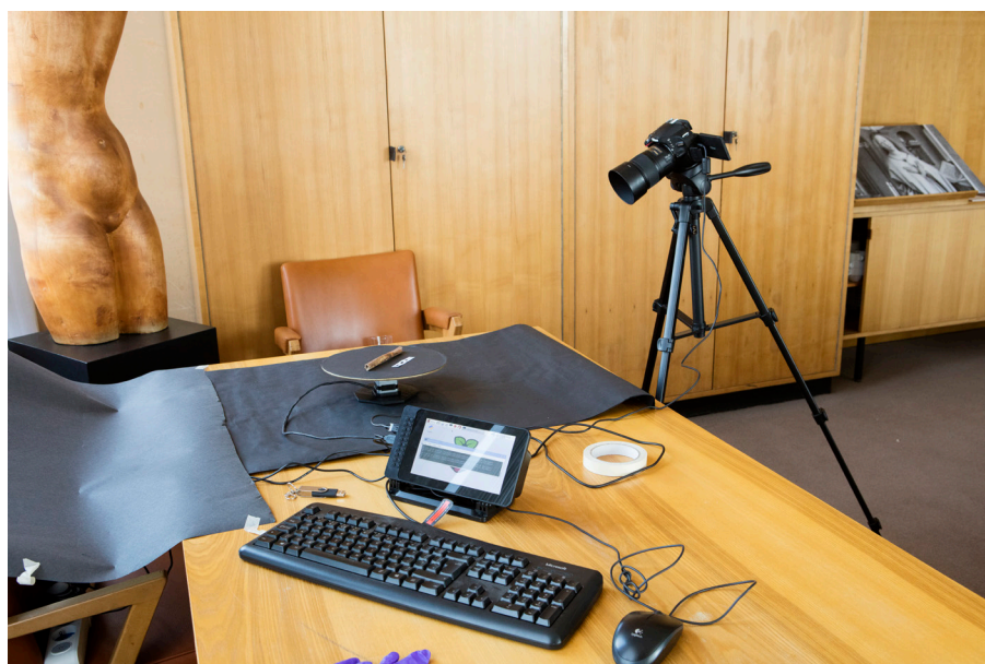
Fig. 5: Computerised turntable system with multi-camera setup developed at RLAHA accelerates the photographic documentation of relics for the creation of 3D photogrammetric images.

further study through photos, measurements and observation is essential. This is particularly important for religious heritage in Northern Europe or the Middle East, where evidence that can often be endangered by incidents of theft, arson, vandalism and general decay due to lack of funds. The authors' documentation of texts and objects on-site is carried out photographically and in note form. In the case of relics in particular, measurements are taken along with photographs from multiple angles, allowing for the preparation of 3D images by photogrammetry. For this, a new, computerised turntable device connected to three cameras at different heights has been developed by Richard Allen (RLAHA) (Fig. 5).