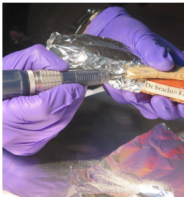
Fig. 8: A surgical drill is used to obtain bone powder from a relic using the “Keyhole” sampling method. The quantity of powder on the foil indicates the sample amount required for a successful radiocarbon date.

excellent condition, allowing the new capabilities of scientific analysis to be tested to their limits, further reducing sample size. Samples of bone material can be extracted almost imperceptibly using a “key-hole” sampling technique, by which a small hole (1mm to 2mm diameter) is made in the bone using a tungsten carbide drill, and use to hollow out sample material from within the object (Fig. 8).