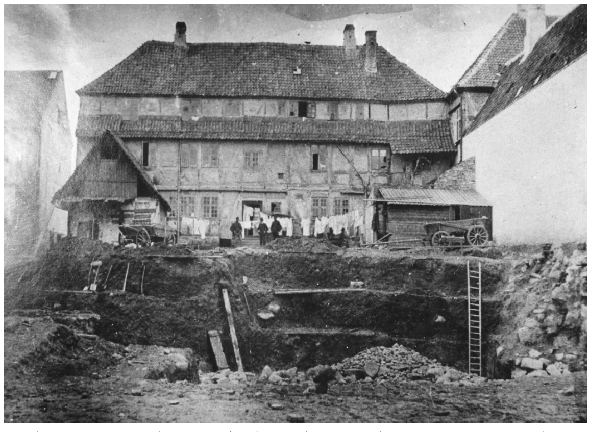
Photo: Excavation in Odense 1915, after photography in Nationalmuseet (1915:499, neg. 88634). https://odensebilder.dk/billedvis.asp? billednr= 36969