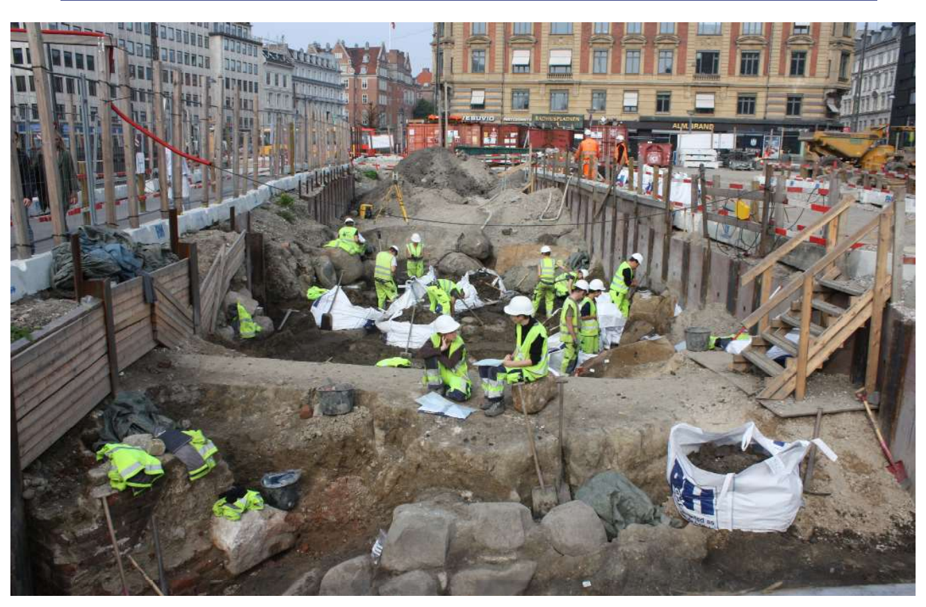
Archaeologists from Museum of Copenhagen excavating late medieval/ renaissance Western City gate in 2012.